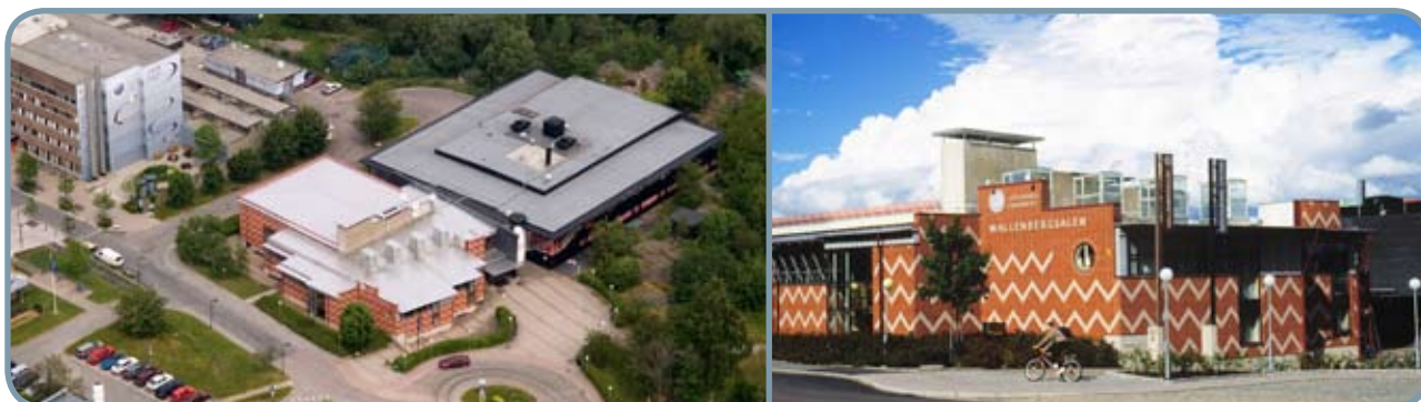
The Conference Centre Wallenberg from above and street view

The trams 7, 8, 13 and rapid bus 16 stop close to the venue (Medicinaregatan).